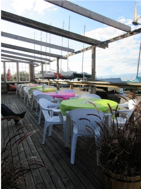
The deck looking festive.