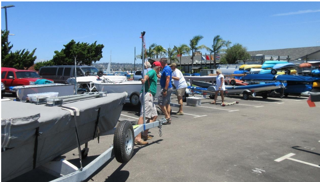
Lots of activity as more and more boats arrive.