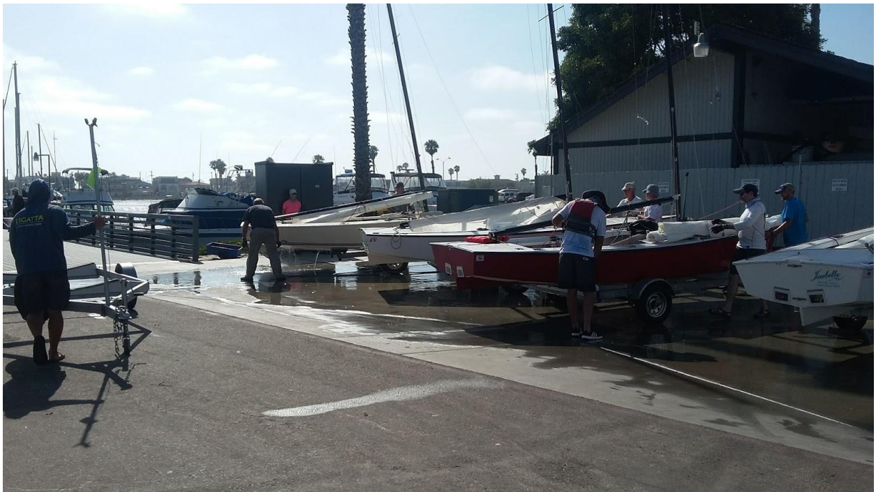
And more boat washing.