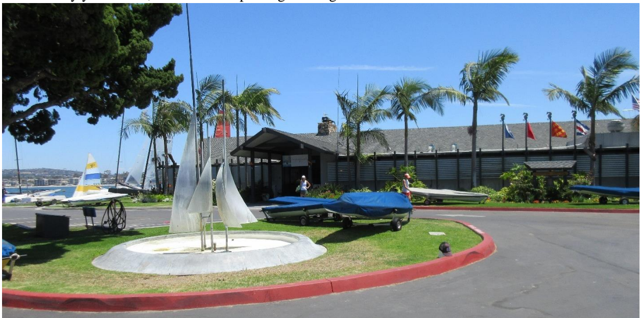
Another view of the clubhouse.