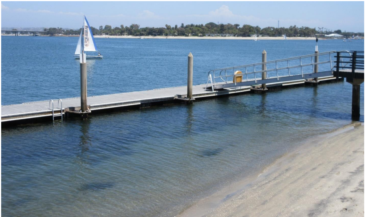
View of the club dock, taken from the covered deck attached to the clubhouse.