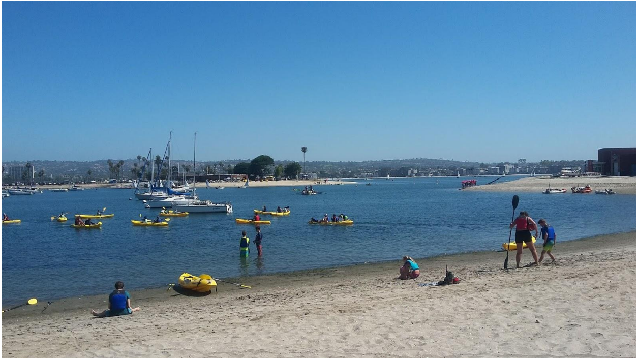
Kayak lessons in full swing.