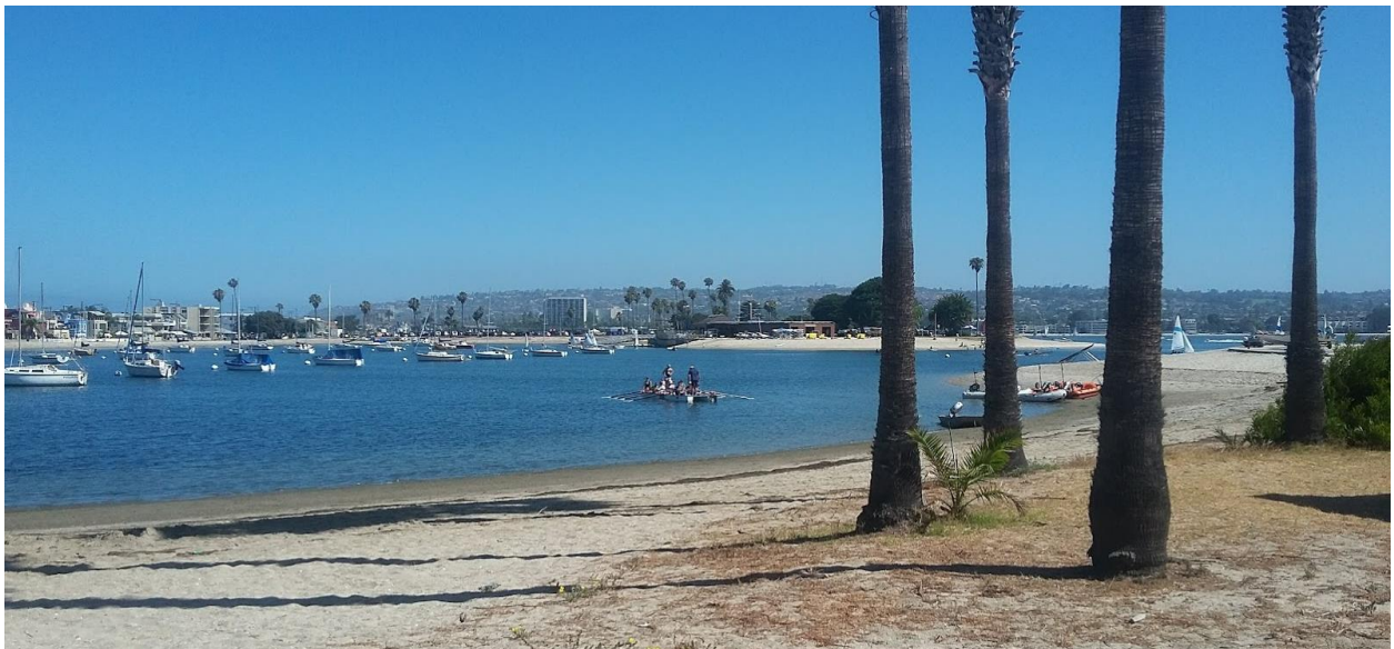
This was a very large canoe, not an OC6 or a dragon boat and also a training boat....