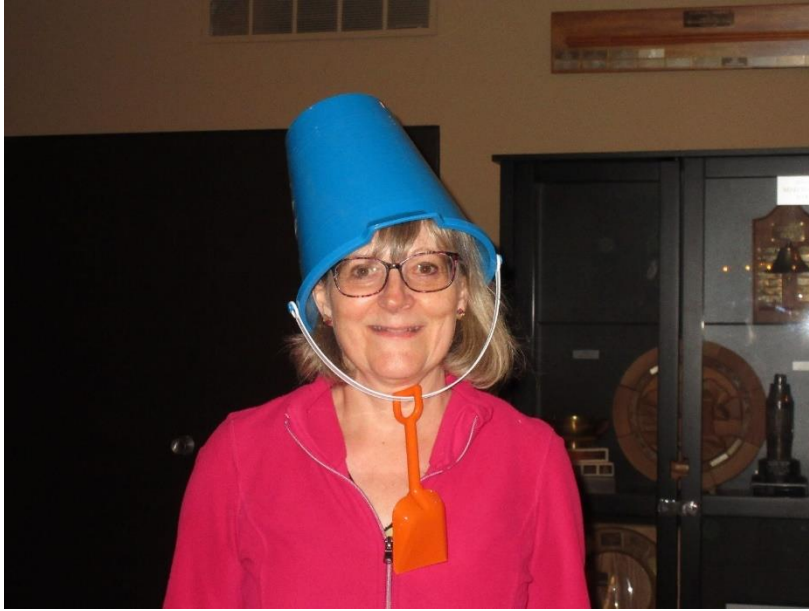
Rosemary and, yes, a bucket counts as a hat.