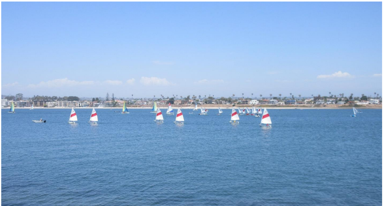
And, of course, sailing lessons! A lot of sideboard equipped Sabots!