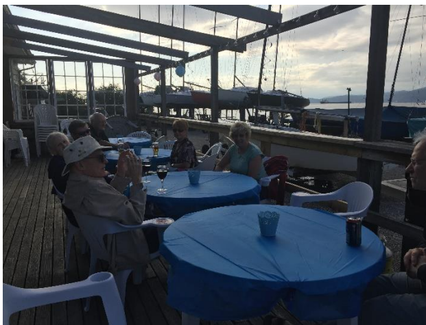
An interesting sky for members to enjoy while waiting for the boats to come in.