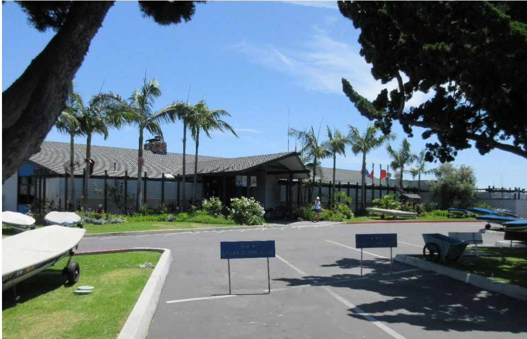
Mission Bay yacht Club, with reserved parking for Flag Officers!