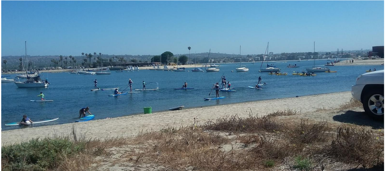
Paddle board lessons....

The Mission Bay area is a very busy water sports location. These pictures were taken on the drive leading to the clubhouse.