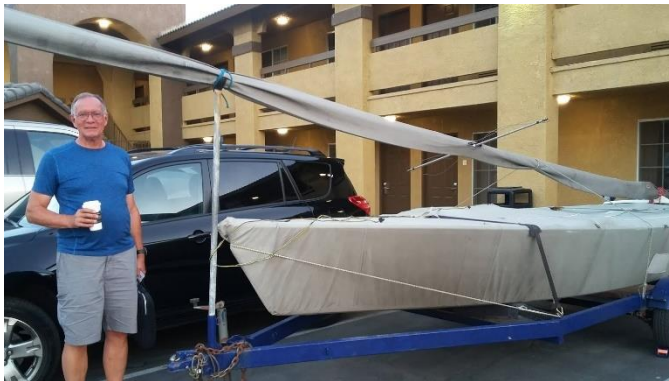
Menno and Ozone in Bakersfield.

Next day's destination was Bakersfield, passing through miles and miles of irrigated farm land, (a bag of 20 fresh picked avocados for $5) and arriving in 38-degree heat.