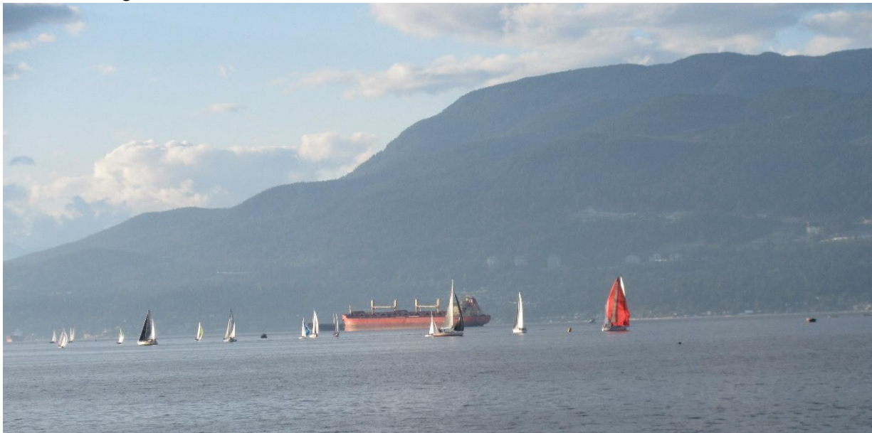
A view of the racing.