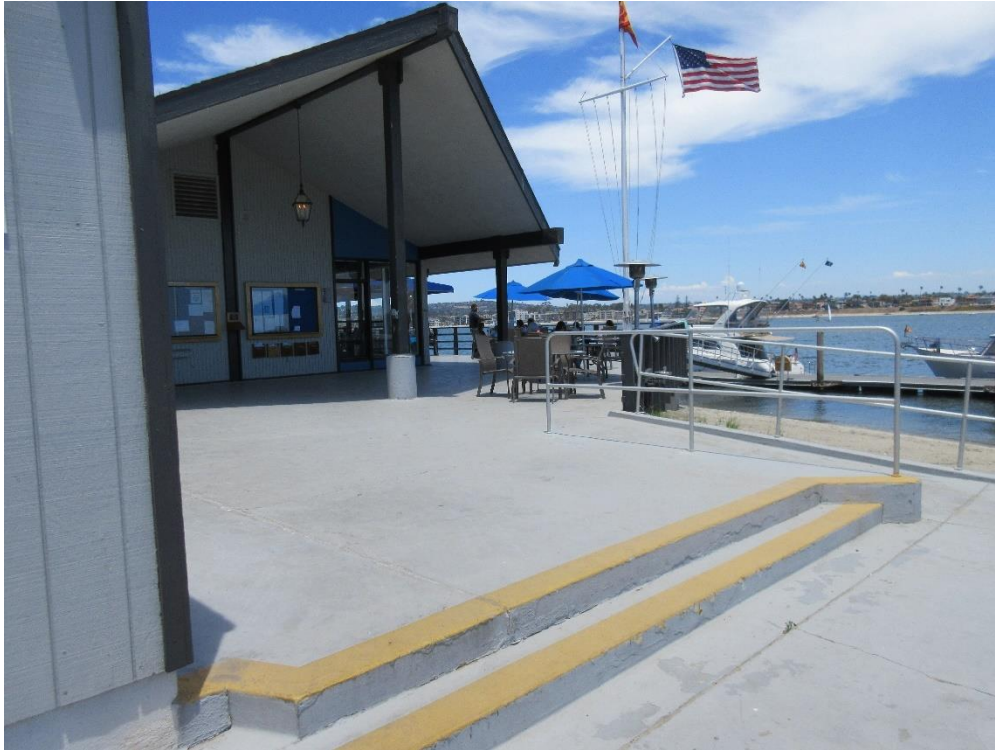
Back of the clubhouse – there is a large covered deck to the left of the blue umbrellas and, off to the left is a sandy beach with picnic tables, an outdoor kitchen and another club building with additional washrooms and showers.