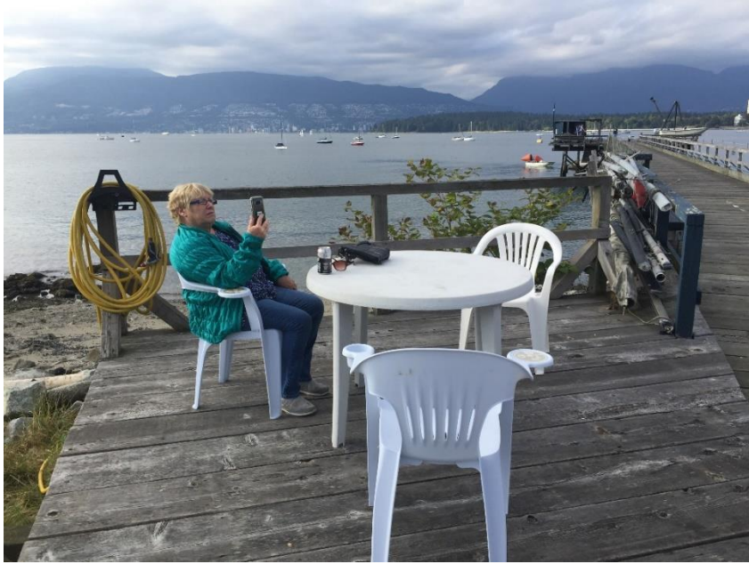
Kit, relaxing on the deck.