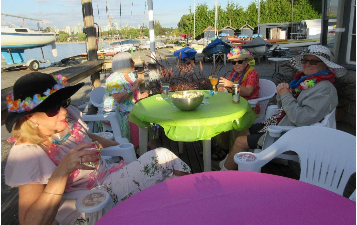
Members enjoying the deck.