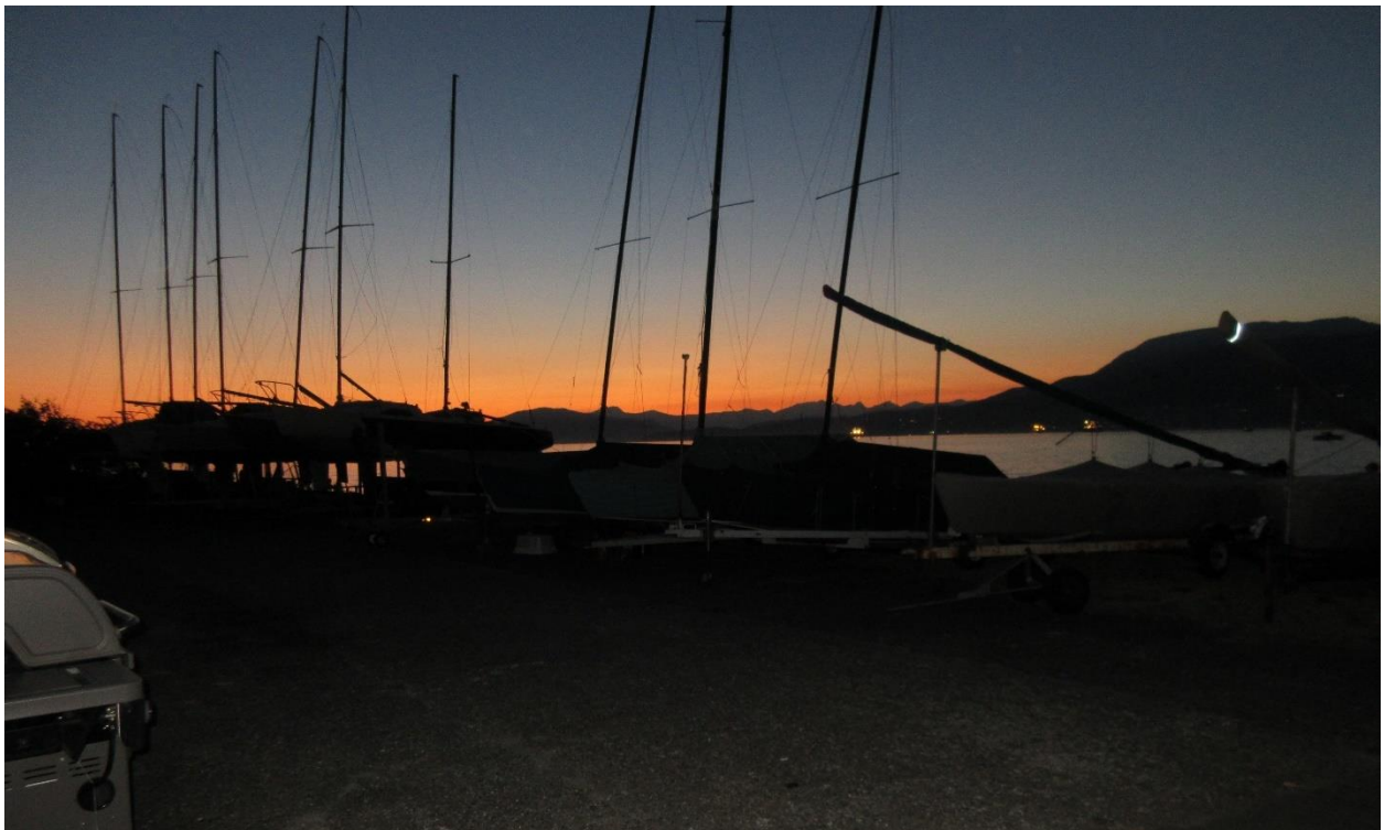
Sunset on a beautiful evening.