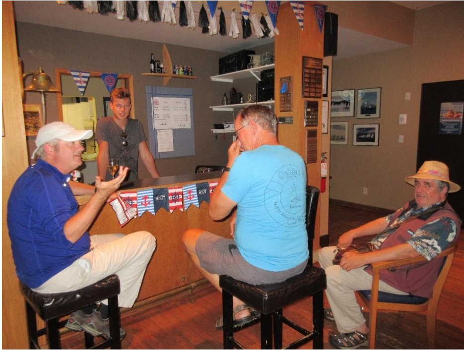
Party at the bar at the end of the evening.