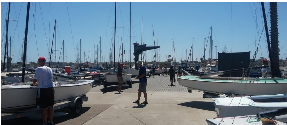
A view of the yard at Mission Bay Yacht Club.